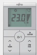
Simple Wired Controller (without Operation mode)* UTY-RHRYT

*Optional Communication Kit required for connection