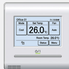
Wired Touch Controller* UTY-RNRYS