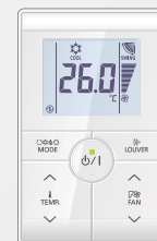
Simple Wired Controller* UTY-RSRYT